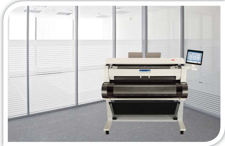
Space Saving Design